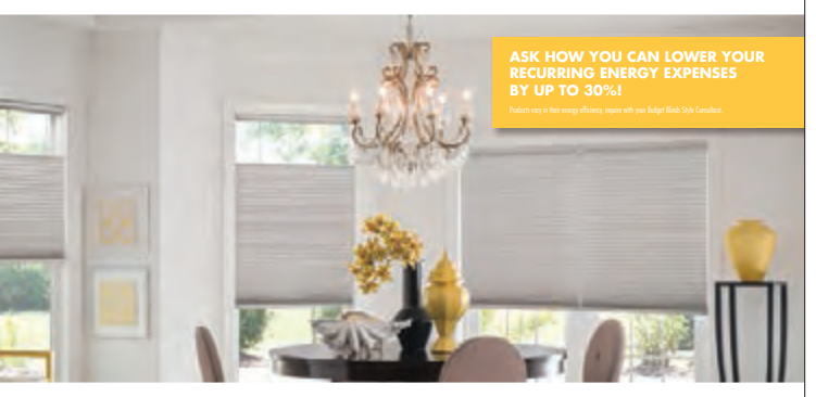
GET A REBATE UP TO $250* *Offer good from April 1 to May 31 2016

THE MOST EFFICIENT WAY TO BUY WINDOW COVERINGS. NOW WITH MORE ENERGY-EFFICIENT SOLUTIONS.